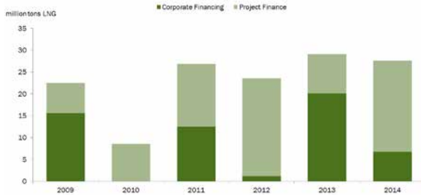
Figure 2: LNG Projects by Financing Scheme and Year Approved

Source: Project Finance International, industry press, company announcements